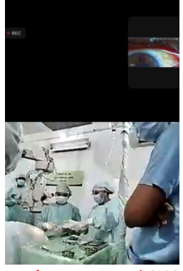
surginar on Manual SICS under E-gurukul