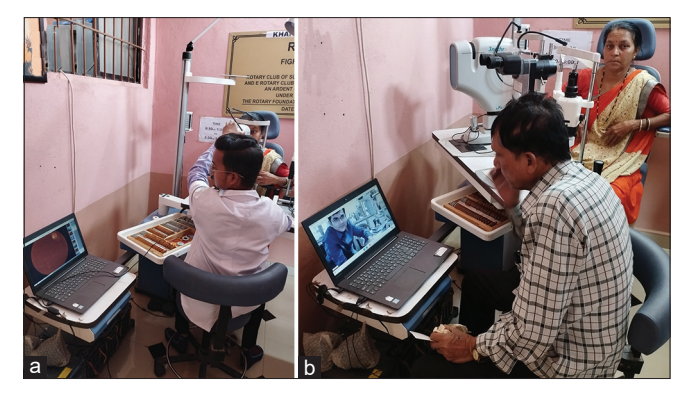
Figure 1: (a) Trained vision technician examining the patient on telemedicine. (b) Photograph depicting patient consulting with ophthalmologist using teleophthalmology services

Furthermore, patients were subjected to refraction studies via an auto-refractor and subjective refraction and measurement of intraocular pressure with iCare (rebound) tonometer (ICARE Finland model TA01I). The intraocular pressure measurement along with optic disc photographs was used to suspect the presence of glaucoma in the patients, who were then referred to visit the base hospital for further investigations. The slit lamp (Aurolab – Hawk I B 2 model) examination and anterior and posterior segment imaging was also conducted without dilating the pupils as we were using a nonmydriatic fundus camera (Forus Trinetra model). The live feed of the examination was transmitted